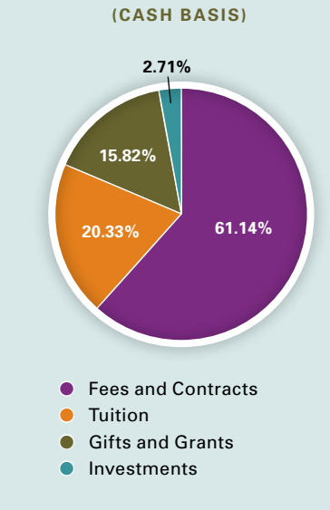
OPERATING REVENUE BY SOURCE 61.14% (CASH BASIS) 20.33% 2.71% 2.71% 2.71%